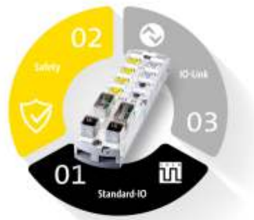
MVK Fusion – the revolutionary 3-in-1 I/O module.

The current trend in decentralisation is the formation of mechatronic units. The modularisation of machines and plants is regarded as the business model of the future: Standardised mechatronic units