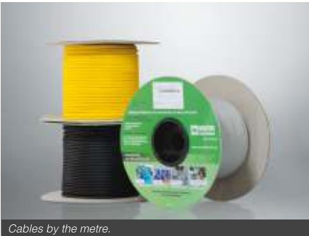
Cables by the metre.