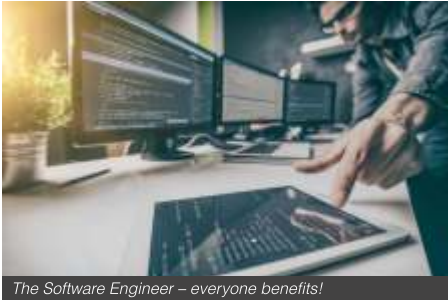
The Software Engineer – everyone benefits!